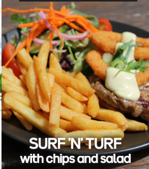
SURF 'N' TURF with chips and salad