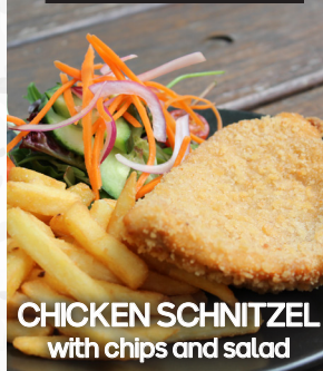
CHICKEN SCHNITZEL with chips and salad